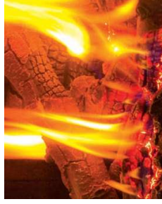
9 Piece ultra high definition log set