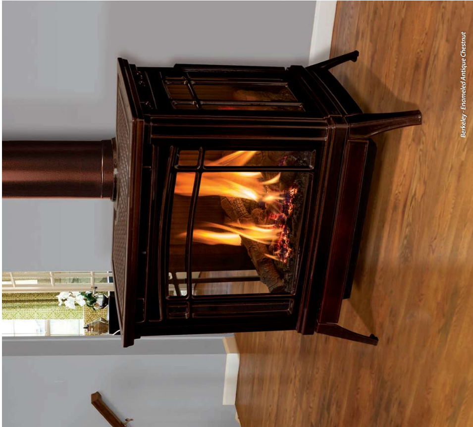
Berkeley - Enameled Antique Chestnut