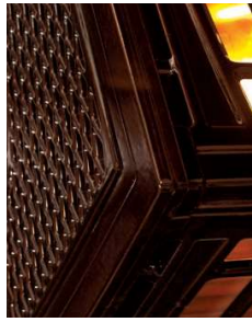
European castings - enameled antique chestnut