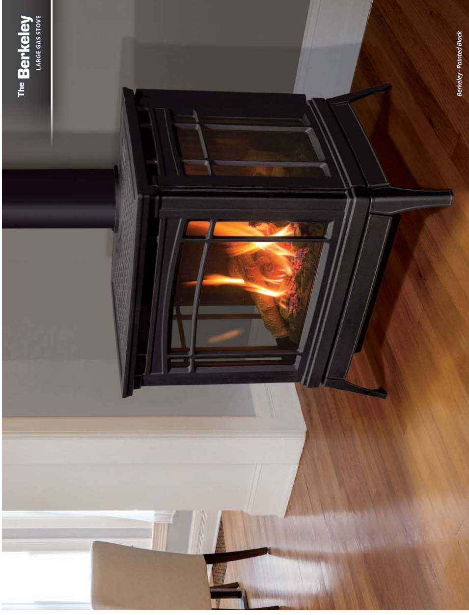
Berkeley - Painted Black